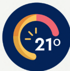
Smart Thermostat & Air Filters