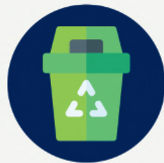
Recycling & Compost