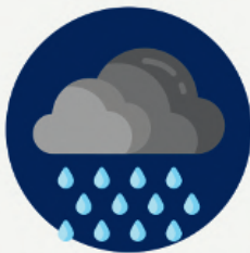
Rain Sensor & Collector